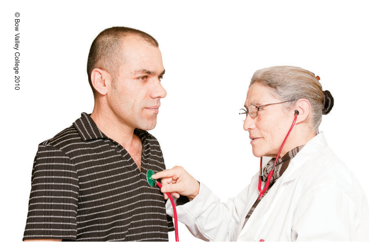
The doctor listens to his chest.