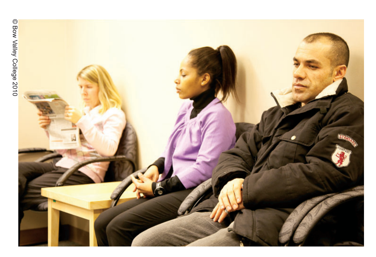
He goes to the clinic.