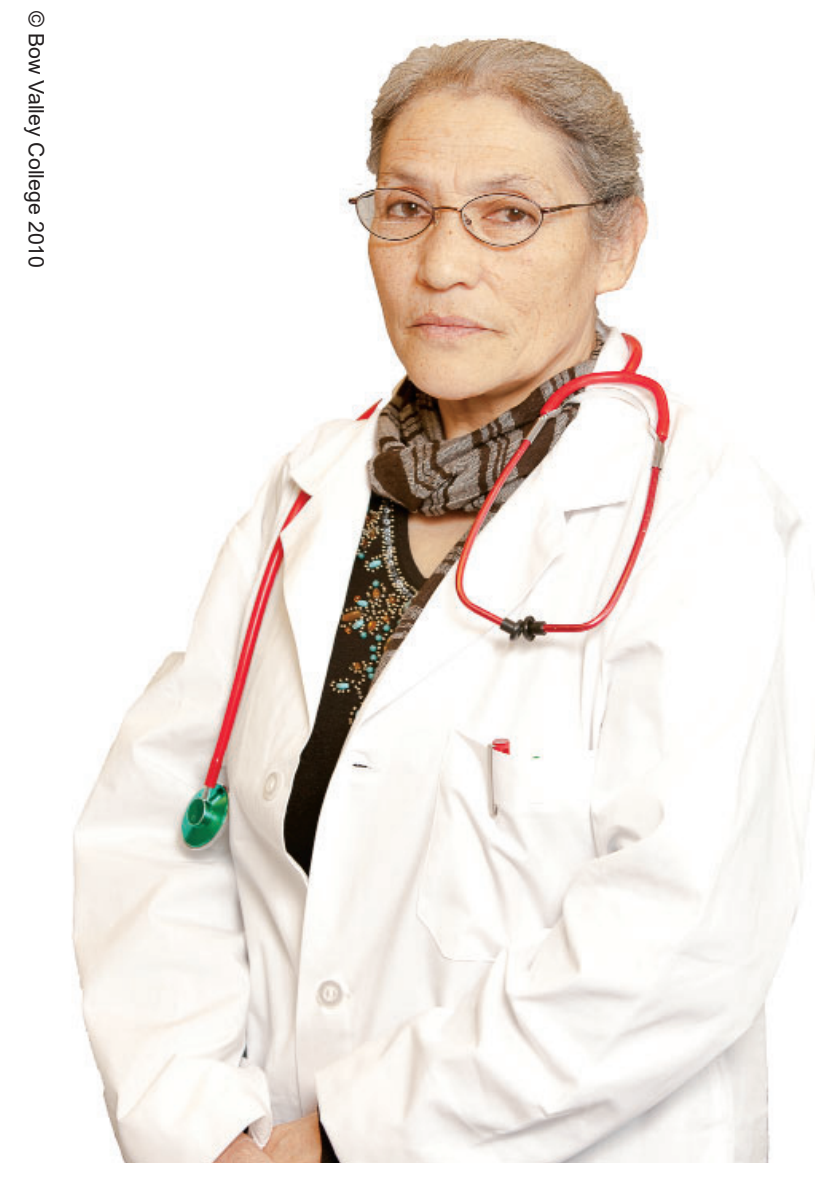
He sees a doctor.