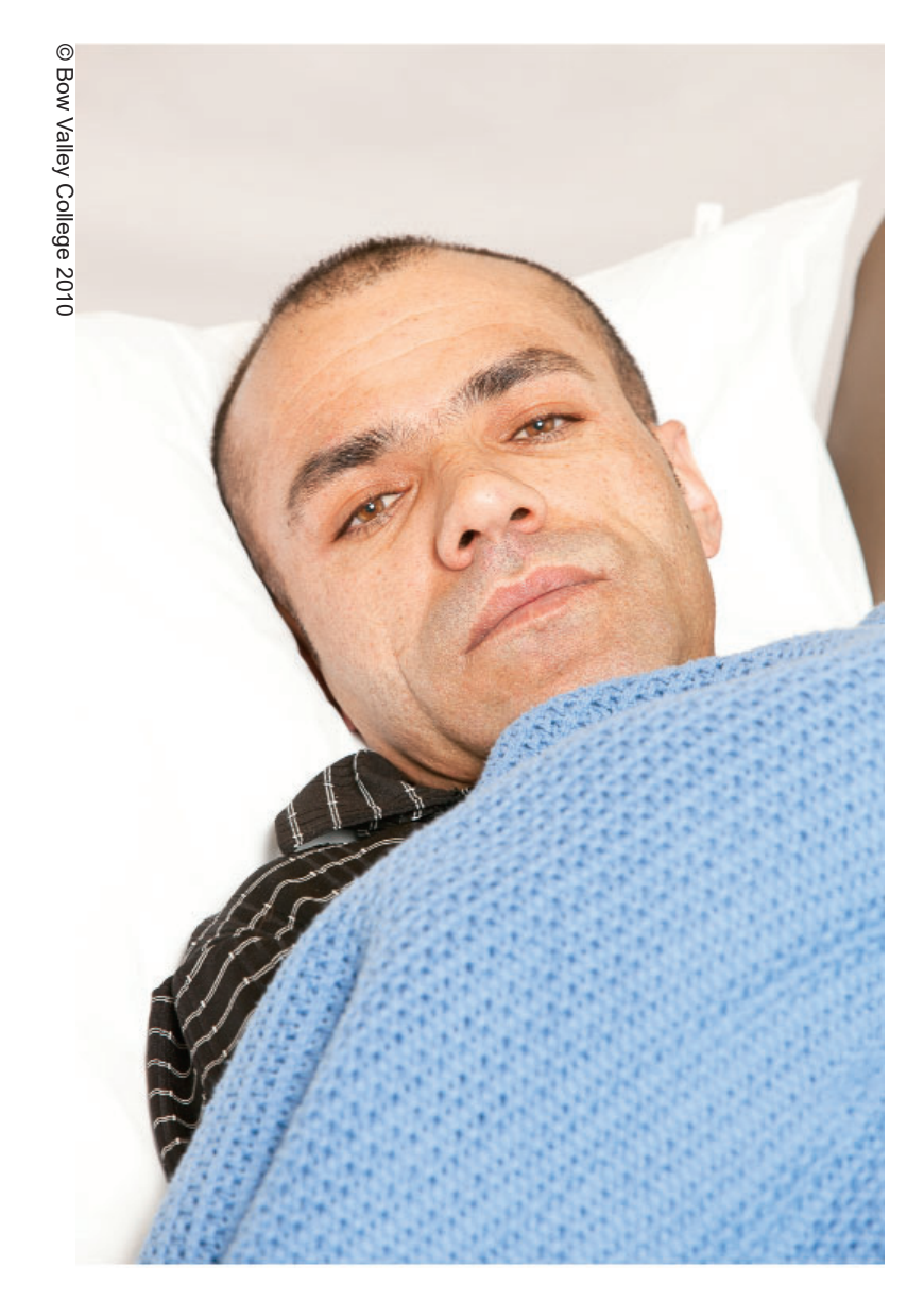
The doctor tells him to rest at home.