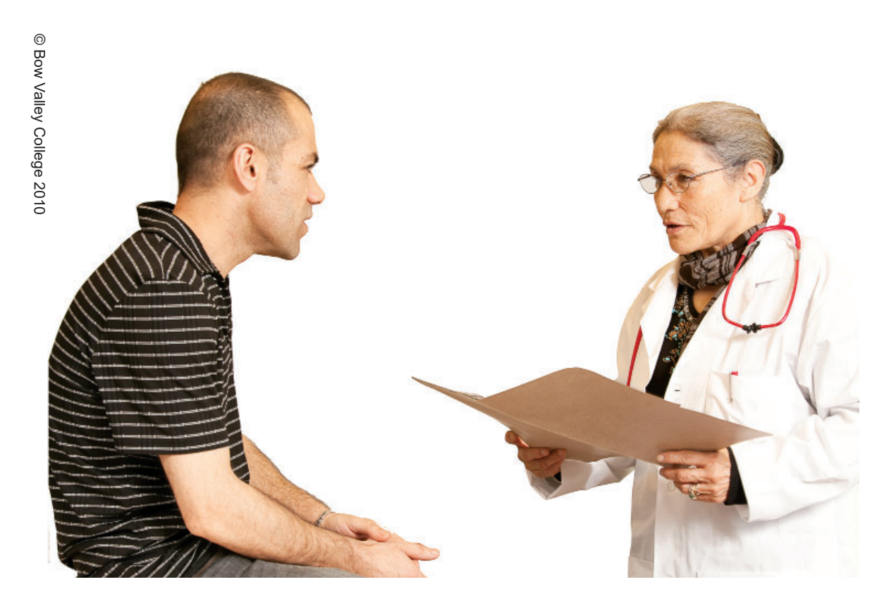
The doctor asks questions.