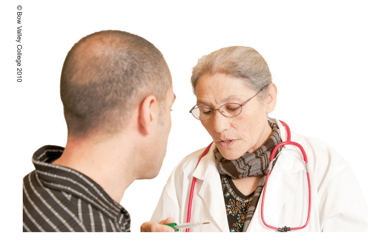
The doctor takes his temperature.