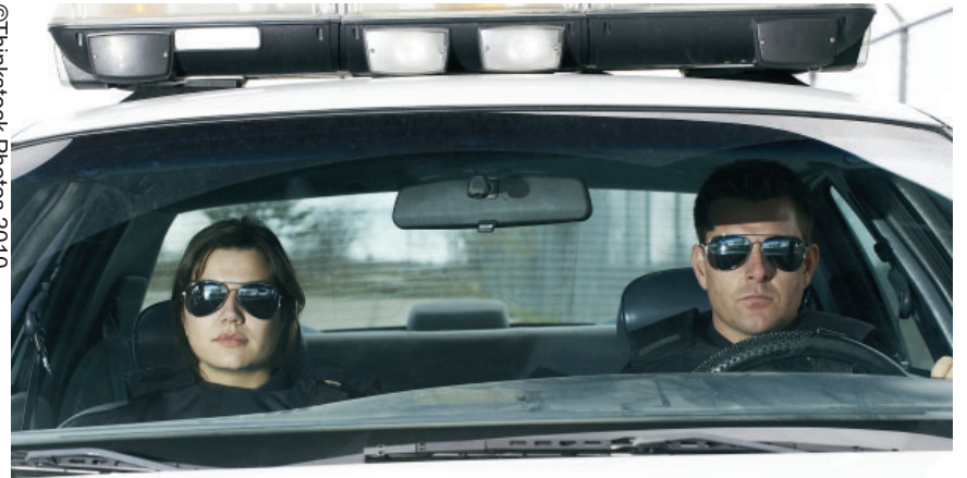
The police are coming for Andres!