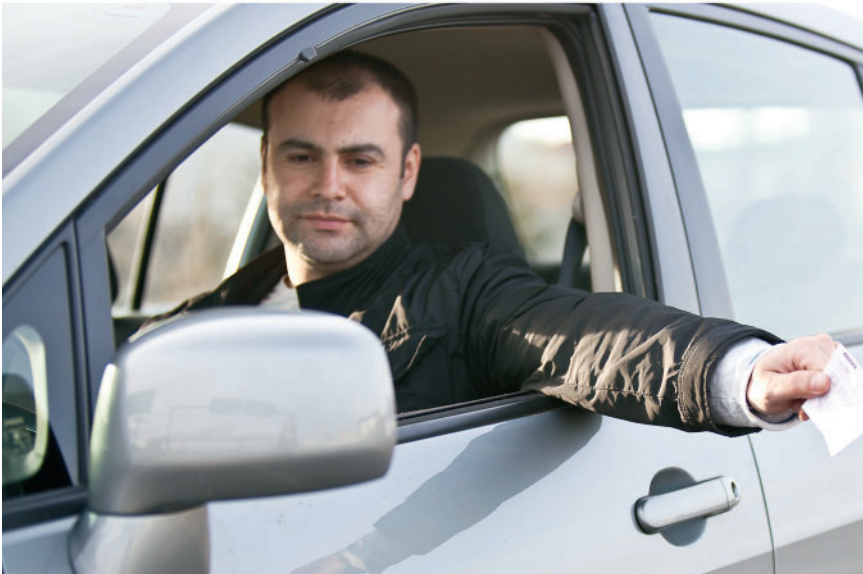
The police ask for his insurance.