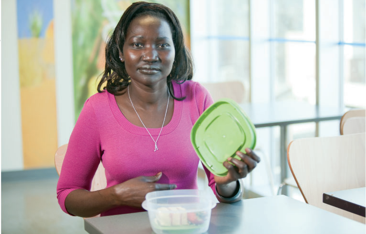
She brings cake from home.