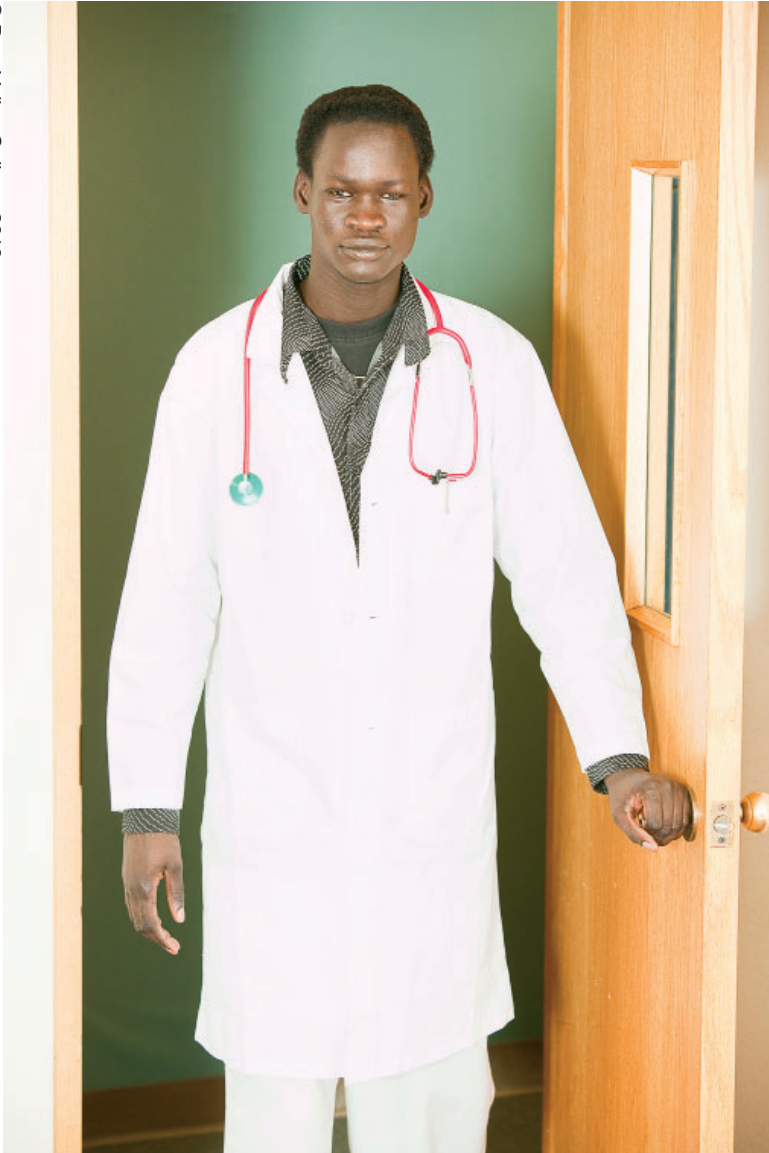
The doctor comes into the room.