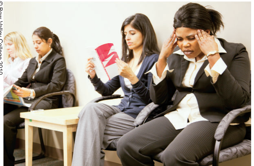
She waits and waits. The clinic is very busy today.