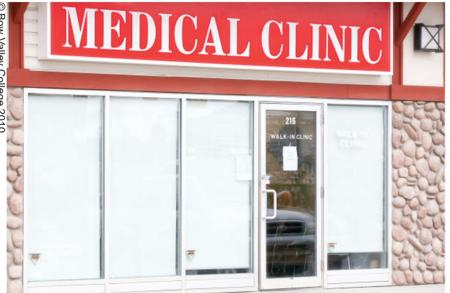
She goes to a walk-in clinic.