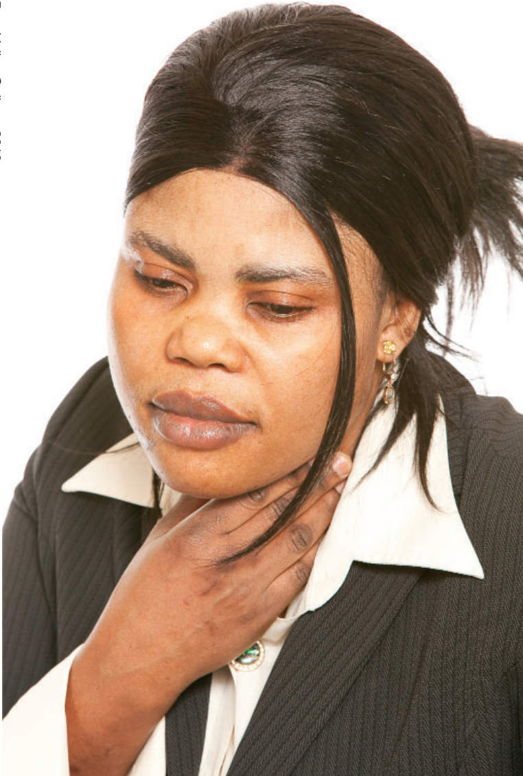
She has a sore throat.