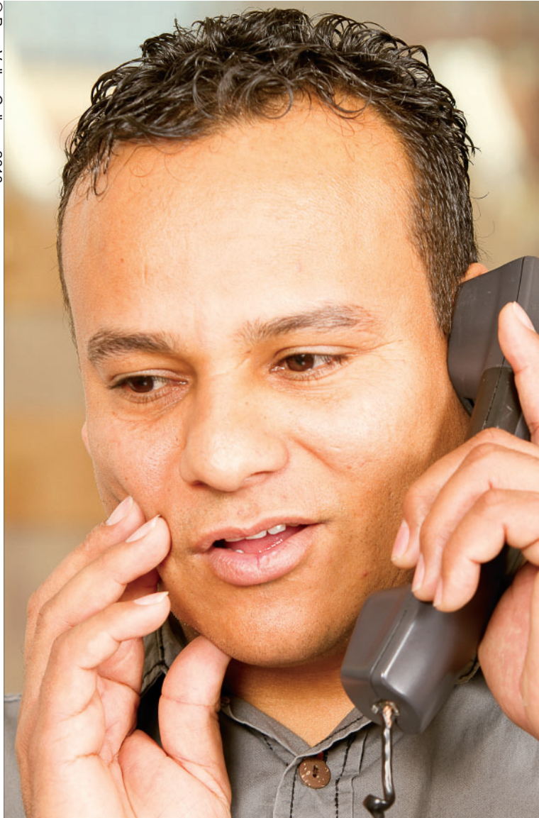
He calls the dentist's office.