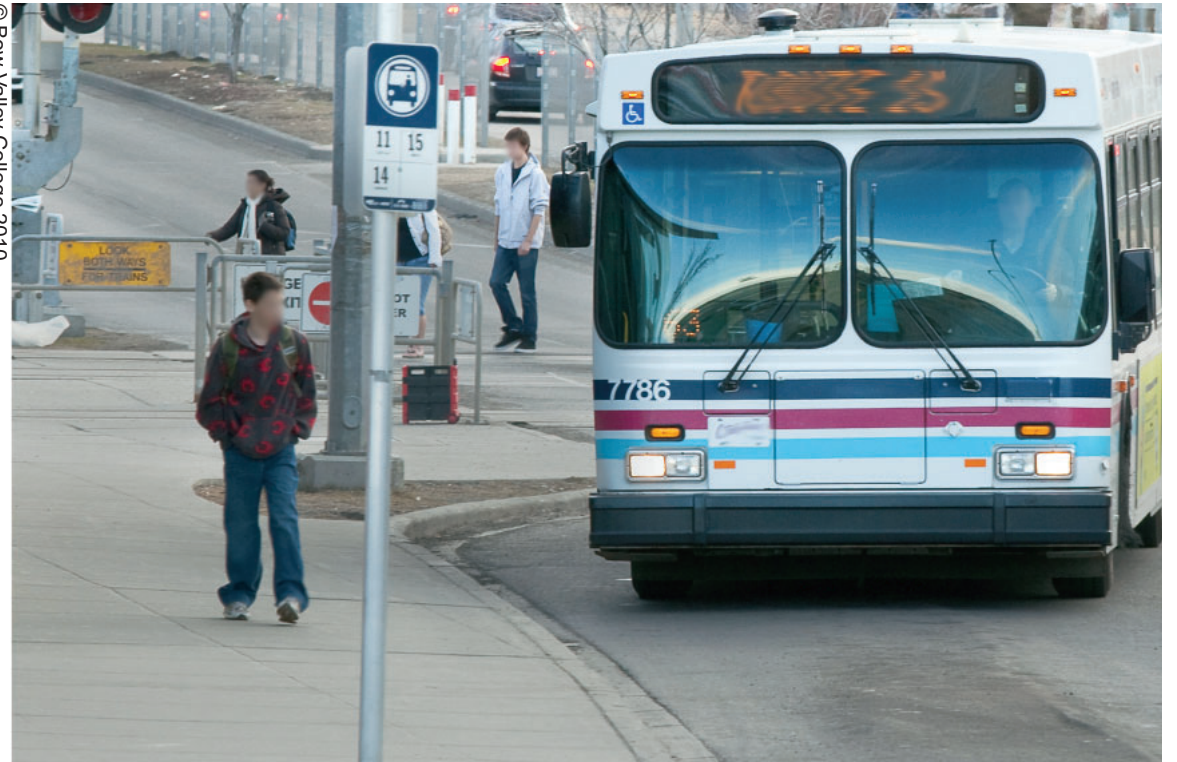
The bus comes.