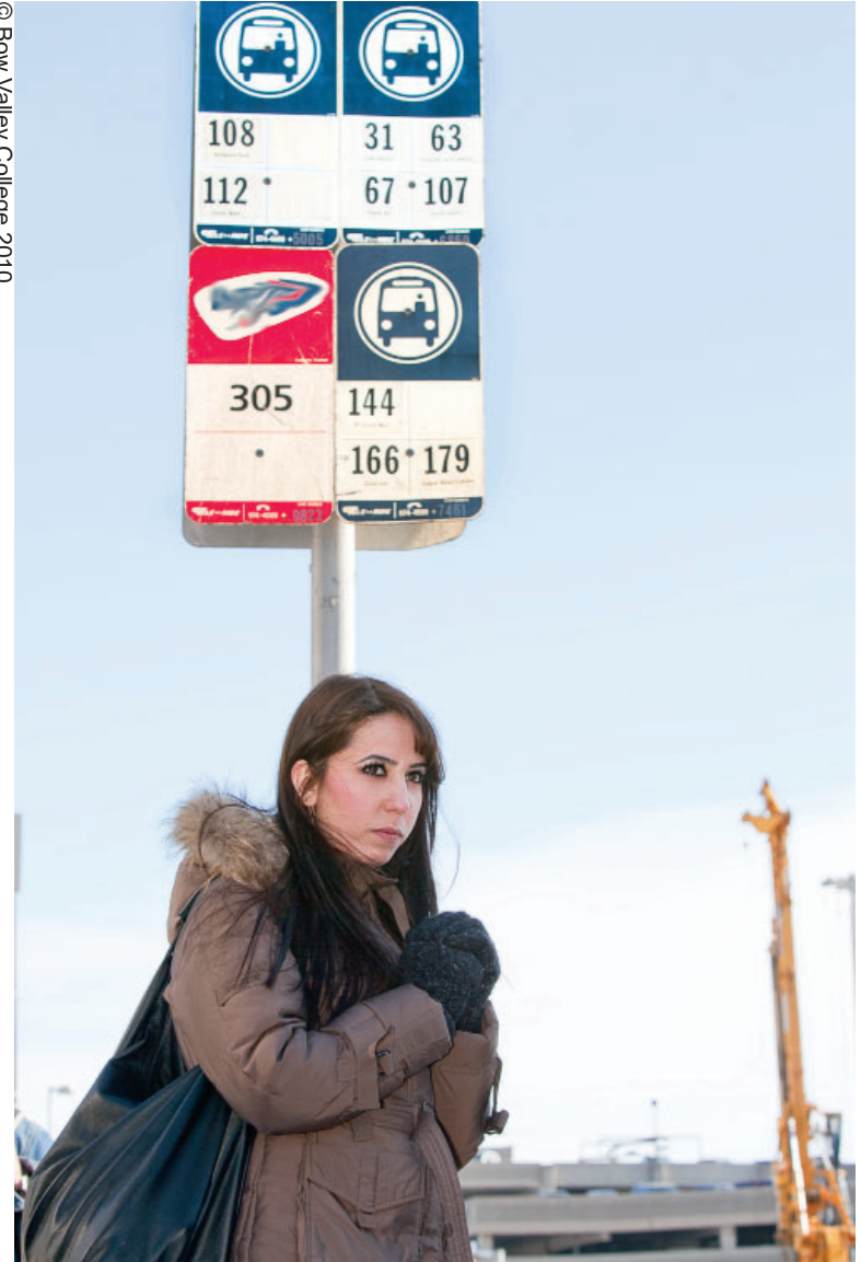
She waits for the bus.