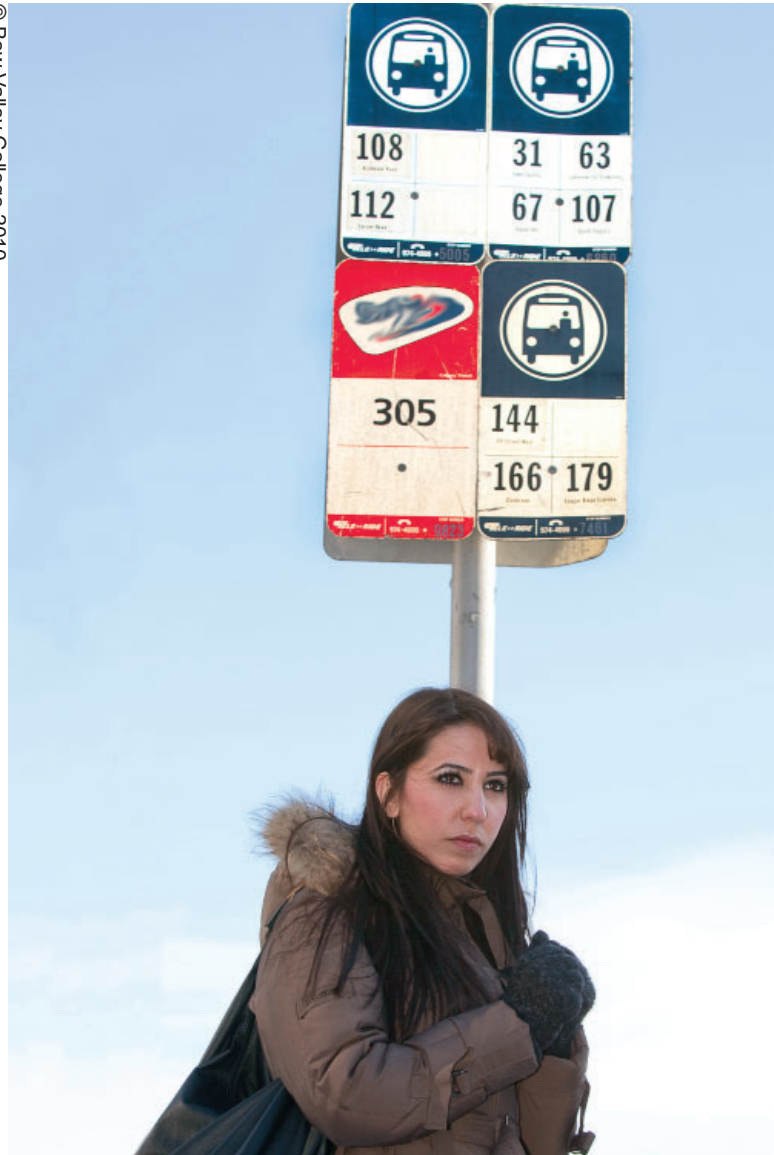
She walks to the bus stop.