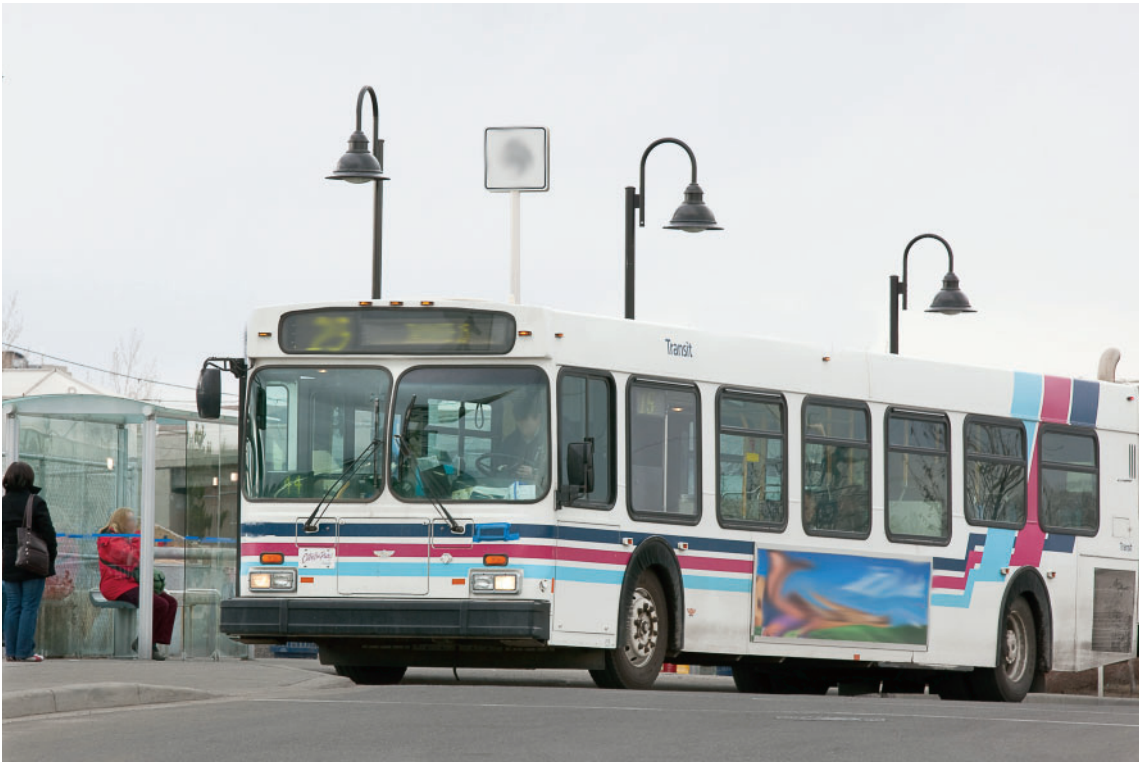
The bus stops at school.