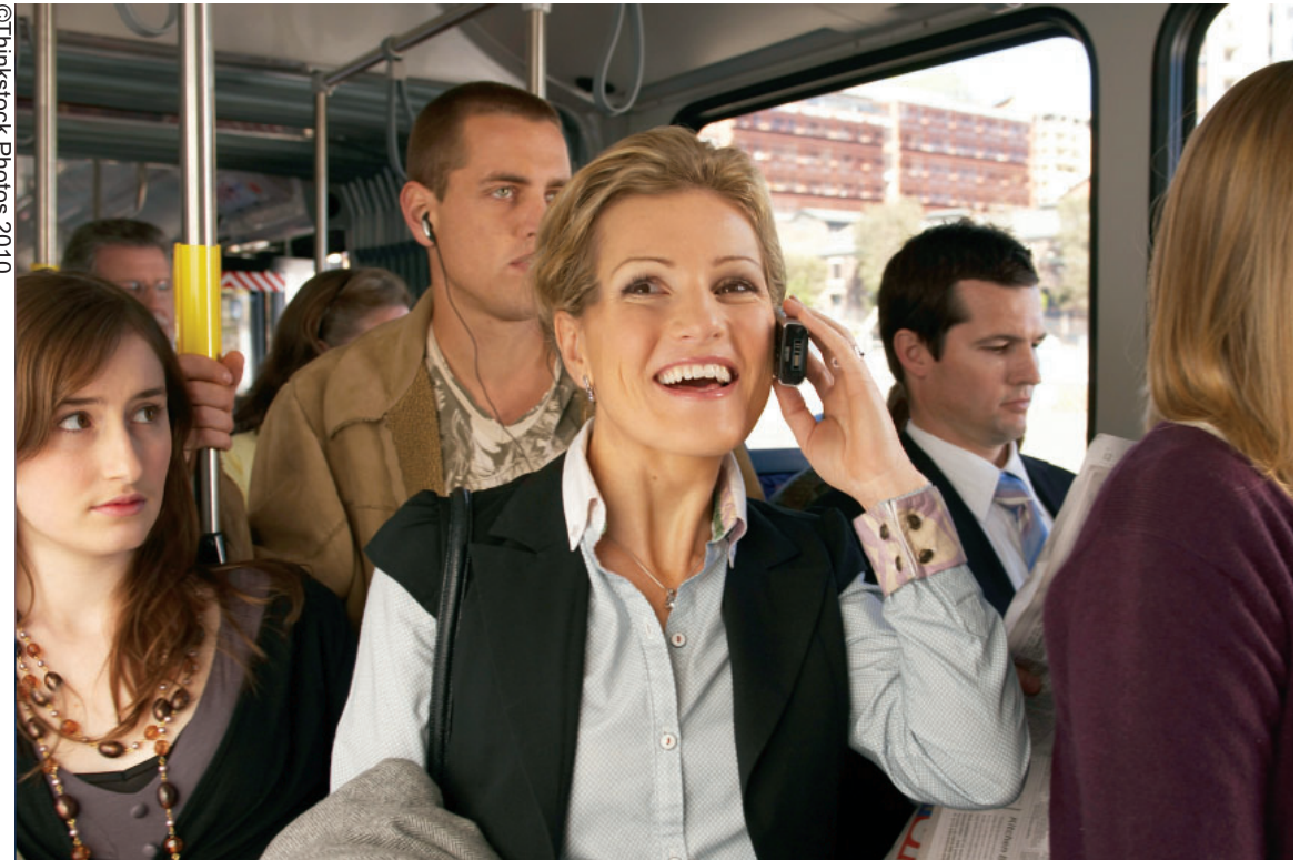
The bus is full of people.