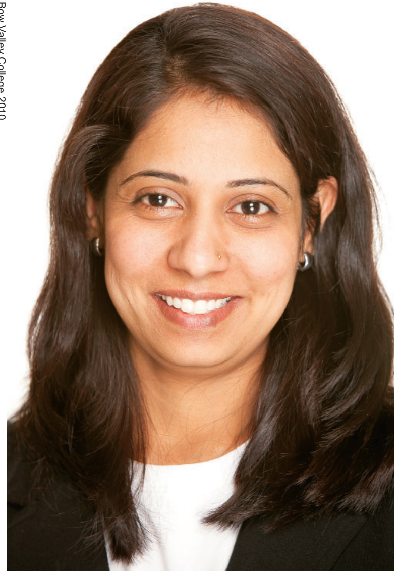
Pooja likes the job. She wants to apply.