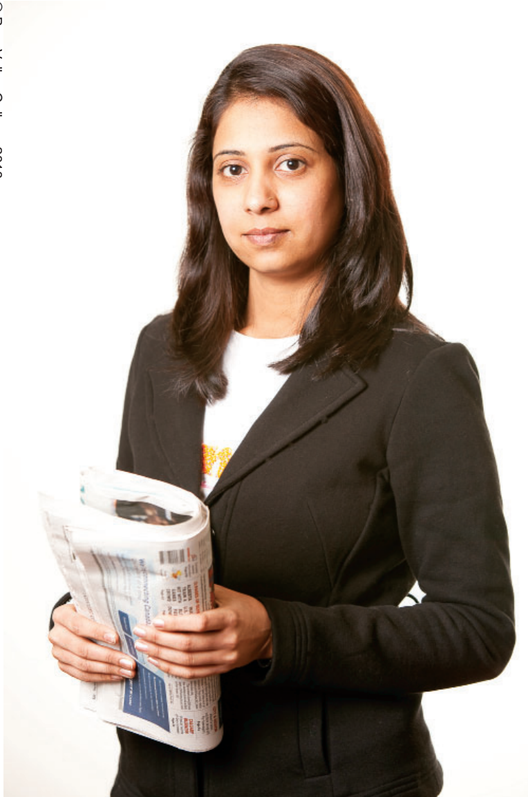
Pooja buys a newspaper.