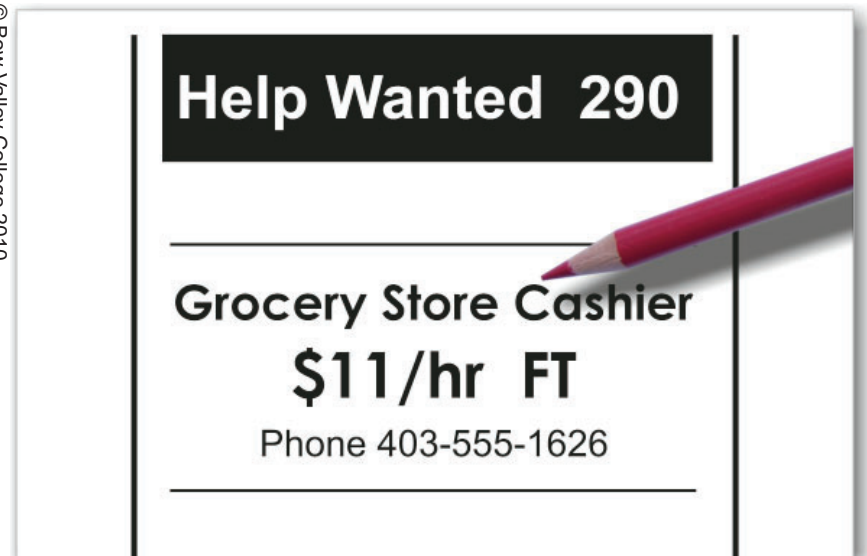
It is for a cashier.