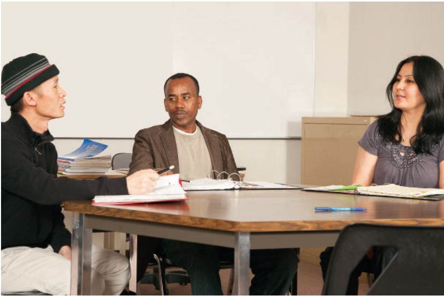
She sees her classmates.