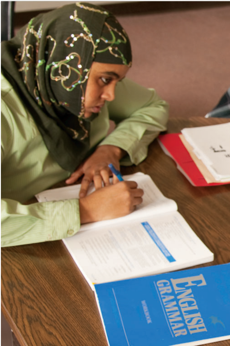
She studies English.