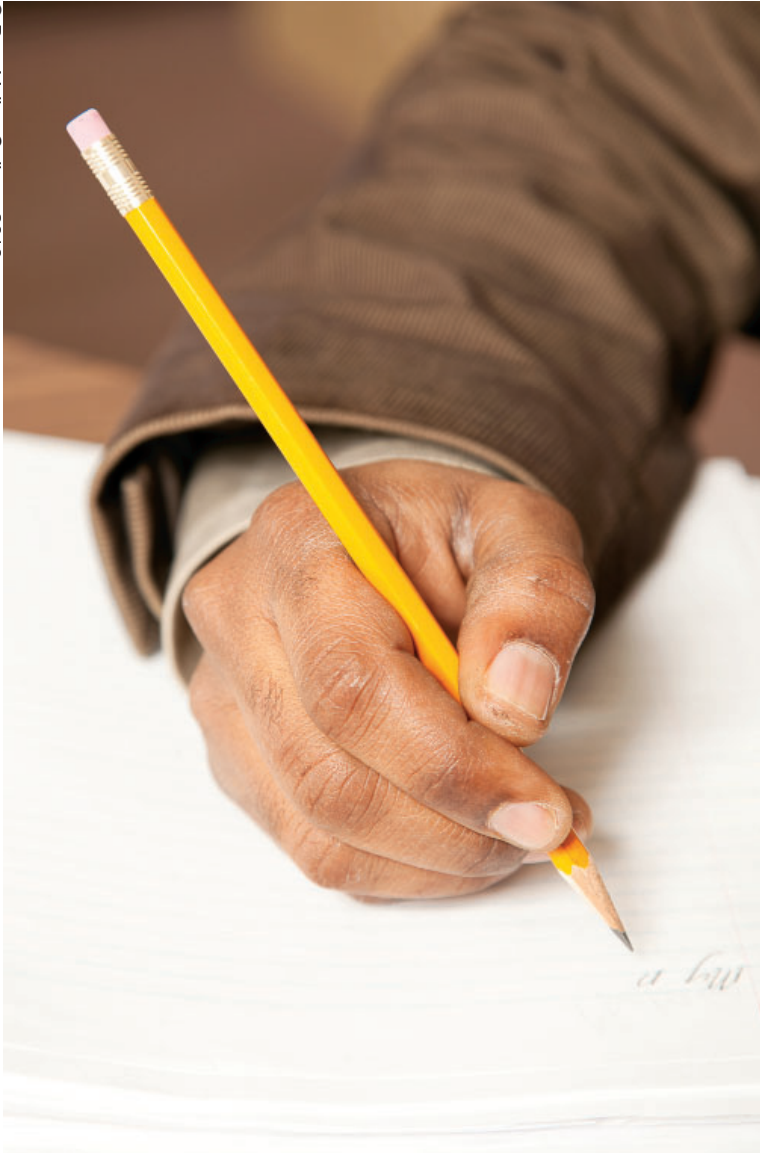
The students take out pencils.