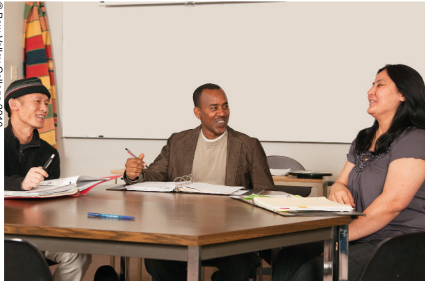
She likes her classmates.