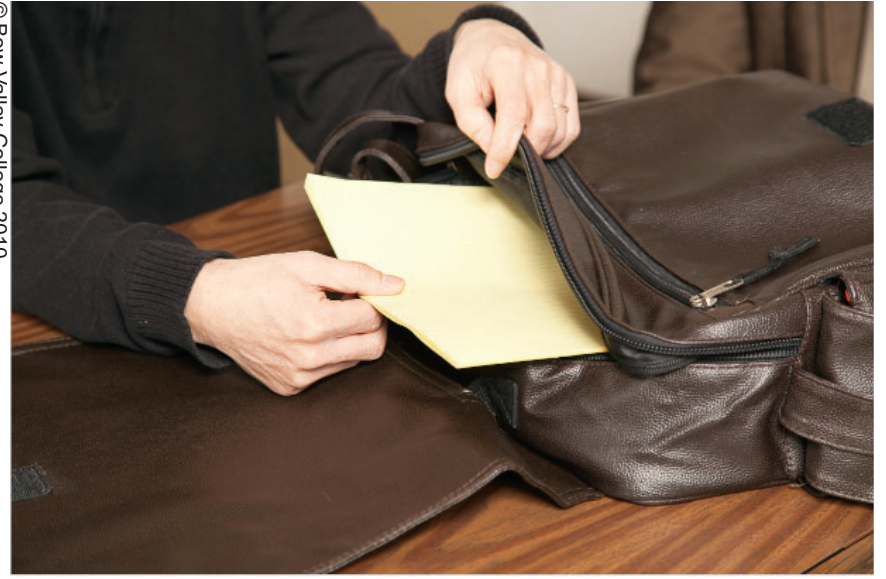
The students take out paper.