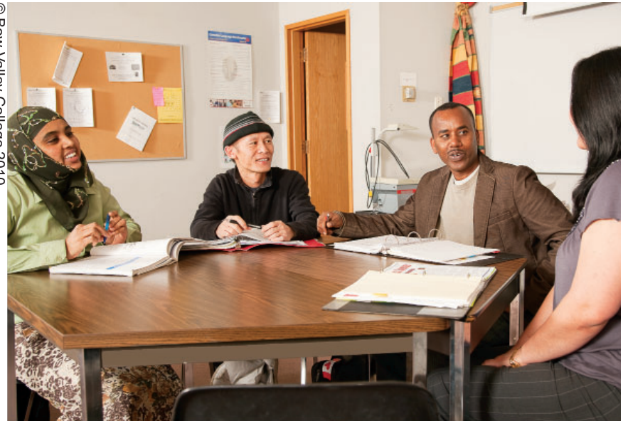
The students talk.