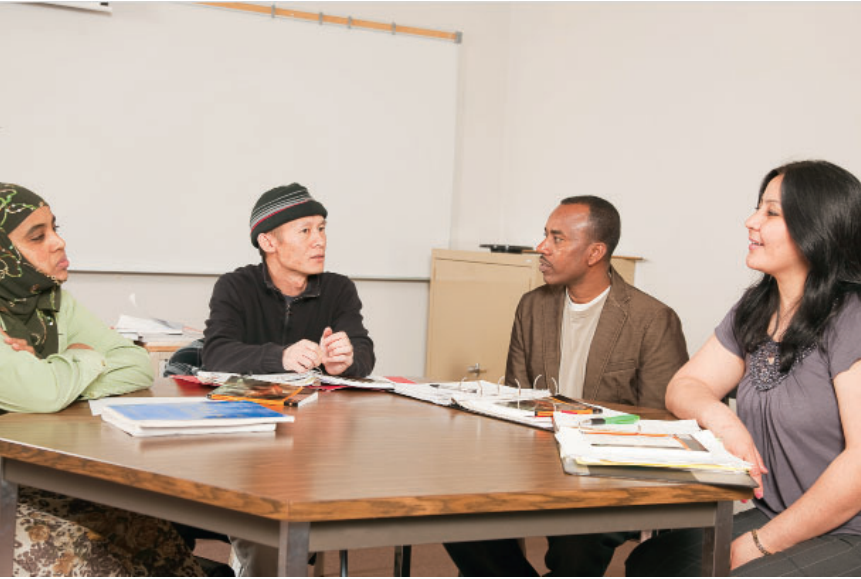
The students listen.