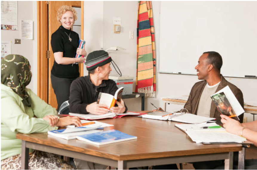
The teacher comes to class.