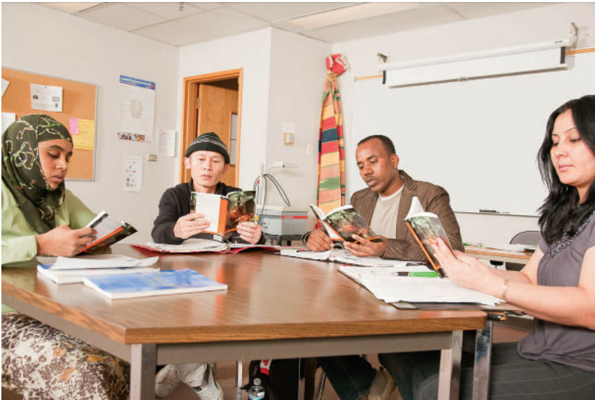
The students read.