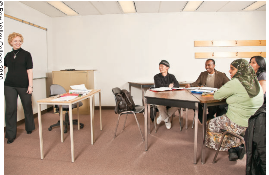
The teacher says "Good morning".